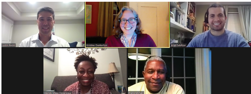
Community Law Center's 2021 Officers of the Board of Directors

Community Law Center is a nonprofit law firm that partners with neighborhood-led organizations and small nonprofits in Maryland, with a focus on Baltimore neighborhoods that have been historically disinvested.